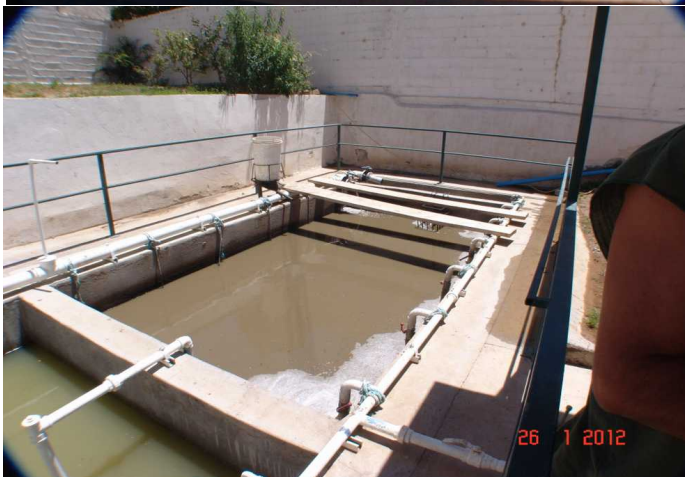
Sewer treated with EcoFlush and EcoGrease in oxidation tank.