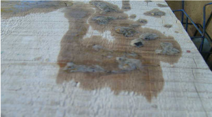
Sewage covered with a thick layer of foam before treatment with EcoFlush and EcoGrease in oxidation tank.