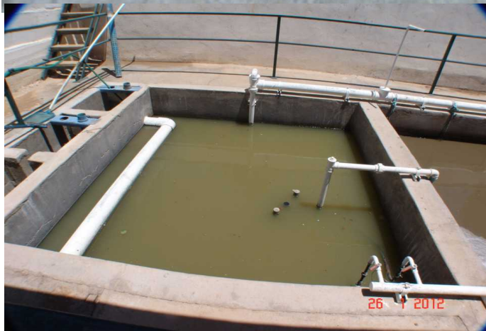
Sewage treated with EcoFlush and EcoGrease in sedimentation tank.